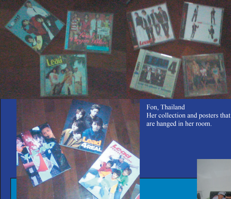
Fon, Thailand Her collection and posters that are hung in her room.