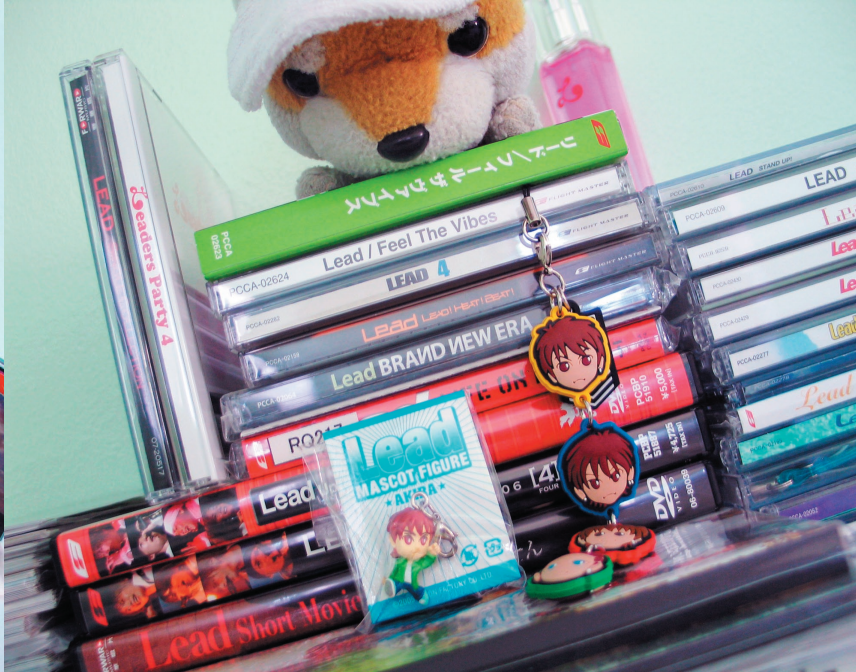
Charmaine N., New Jersey, USA. Collection with "Puppy Shinya".