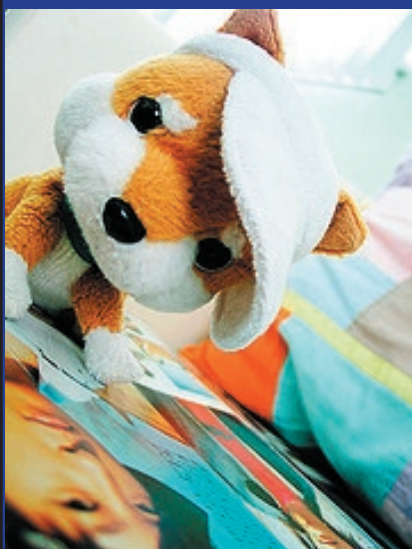
"Puppy Shinya", named after Lead member, Shinya Taniuchi.