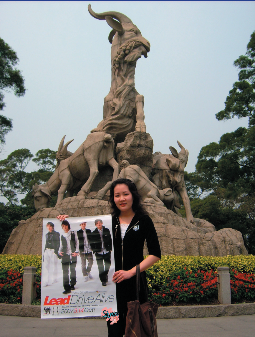
Siyen, China @ GuangZhou (the immortal Five Ram ancient legend as a good reputation flowing down for long ages, the Five Ram Sculpture be regard as Guang-Zhou's symbol)