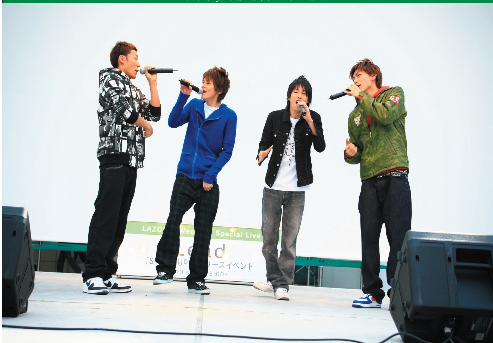
Lead CD Single Release Event, "STAND UP!" Live

To date, the group has released 14 singles (2002-2008) and five albums (2003-2008) including a "Singles Collection" (09.14.2007) released only in Taiwan, reaching #1 on