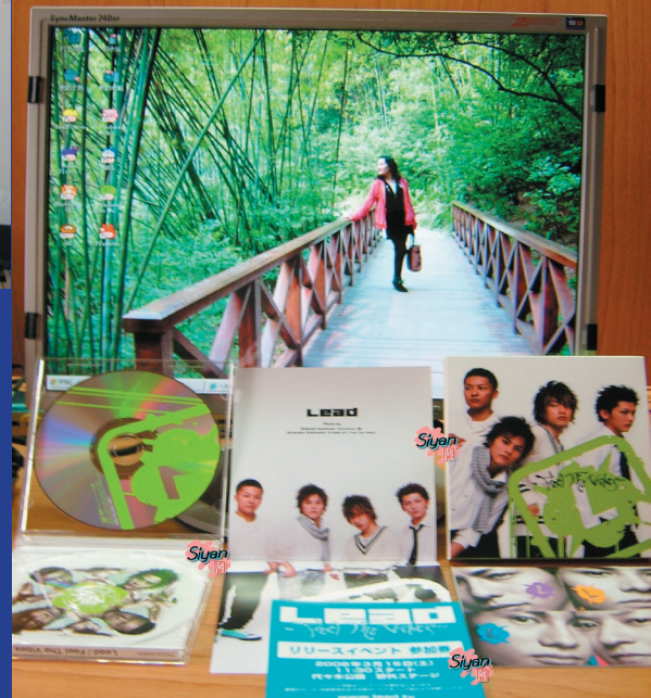
Siyan, China Shows just how much she likes Lead. Rooms covered with their favorite artists is common among fans.