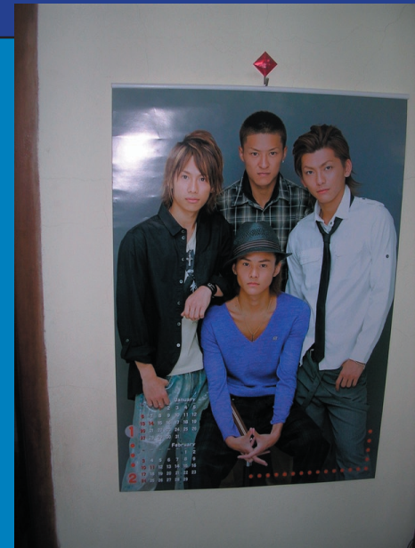
“Lonely cookie”, Vietnam CD, DVD, Photobooks & posters. It is extremely hard to get Lead items in her country but she continues to support.