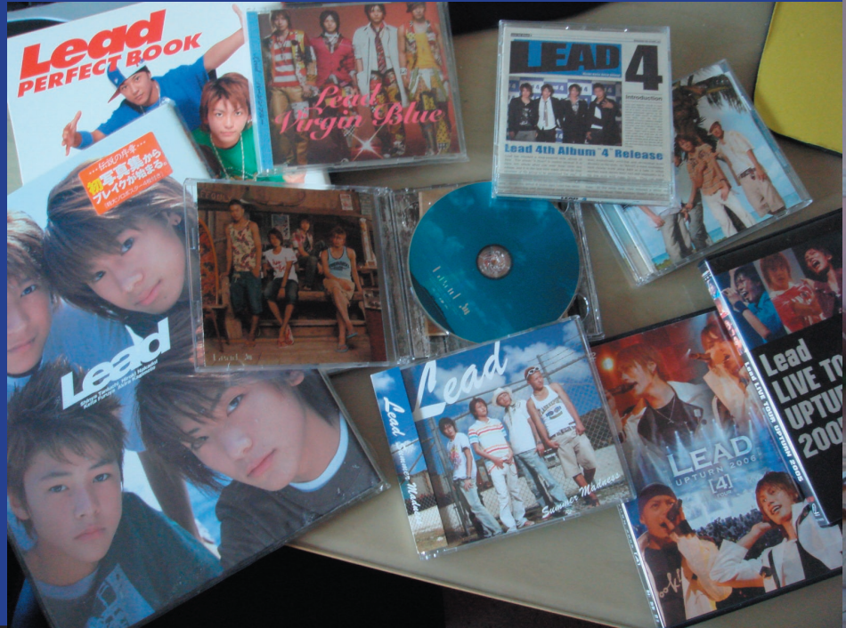
“Kiroyoshi”, Canada with collection and fan art.