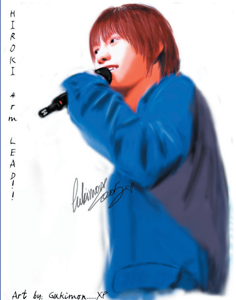
Art by: Gukimon.....XP