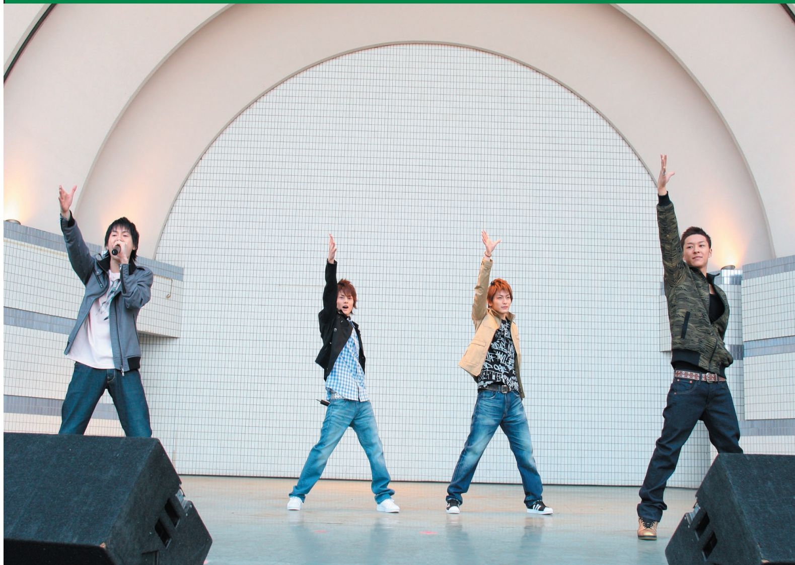
Lead CD Album Release Event, ‘Feel the Vibes’

This year proves to be a breaking point for them as they seem busier than ever. With the release of a single and an album in a month’s time; release events, their annual fan club event. Last year they did a collaboration concert with fellow manage