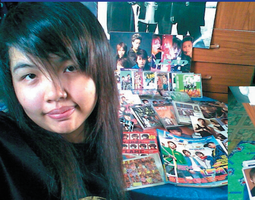
Puy Samutprakarn, Thailand