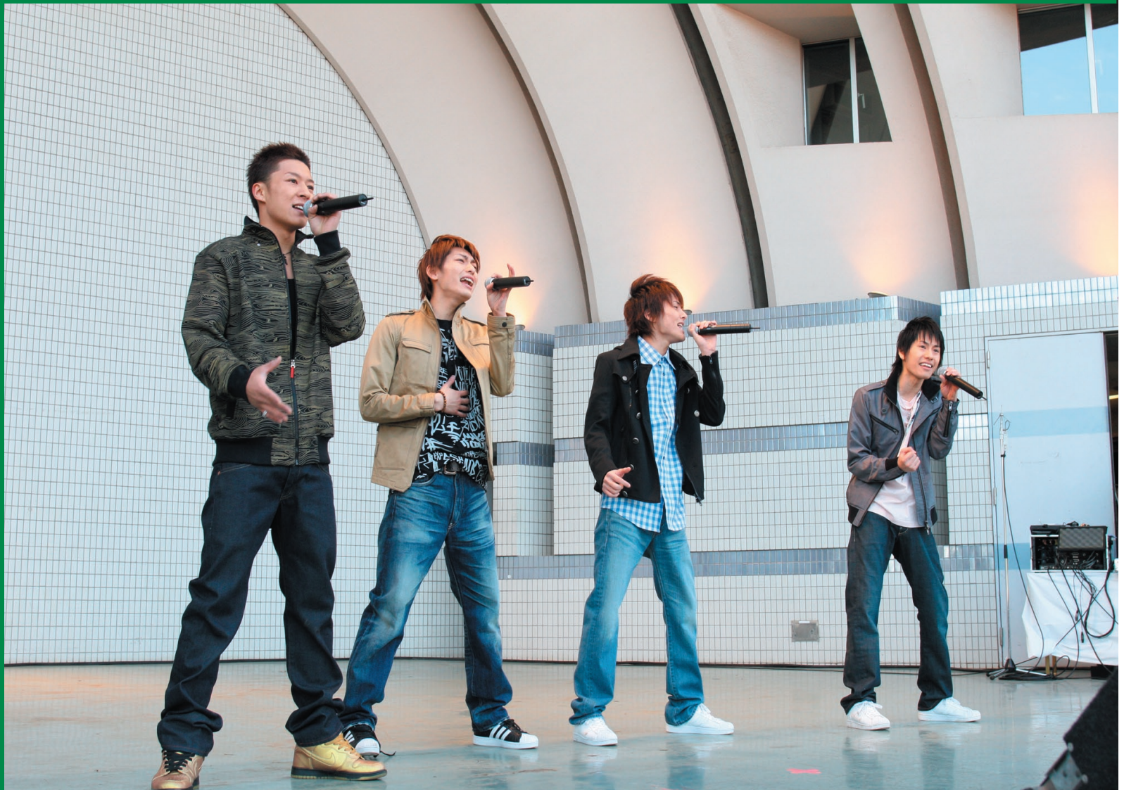
Lead CD Album Release Event, 'Feel the Vibes'