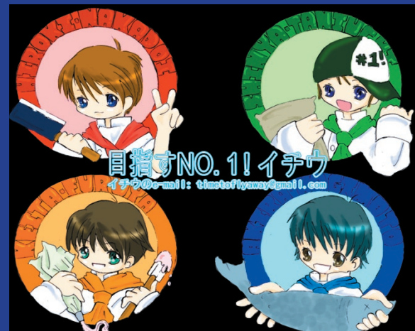
Iron Chef - Lead Generation by "Jido" http://rubberyjido.deviantart.com

Fan art is always a big thing with fans. Some are characterized in different themes, different styles of drawing and even real life art. Here are some drawn from fans.