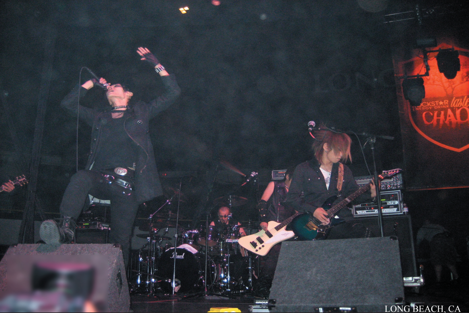
LONG BEACH, CA

Long Beach, CA - when arriving to the venue, fans of Japanese rock bands were all lined up waiting to enter. All of them decked out in their favorite band shirts, pins, accessories or dressed up in some type of gothic Lolita outfit or cosplay.