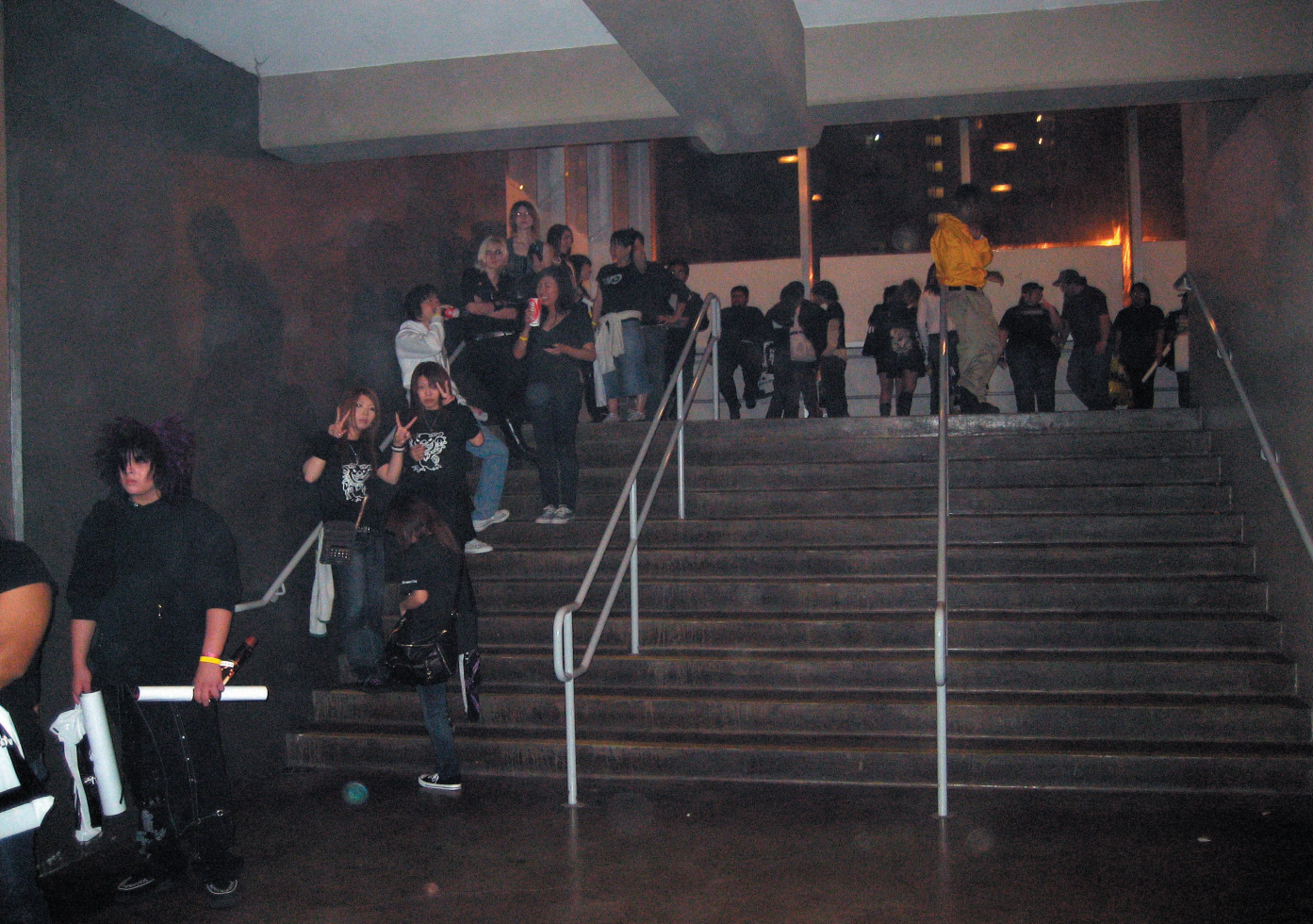
Over 100 people stood in line to meet the bands. It extended over two flights of stairs, as you can see they all patiently wait for their turn.