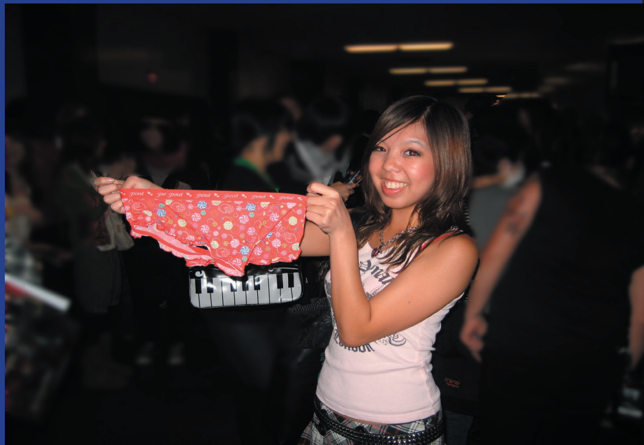
Some fans were lucky enough to get their shirts and arms signed. One was the luckiest one of them all, having an undergarment signed by the bands.